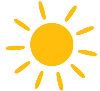
In the Morning