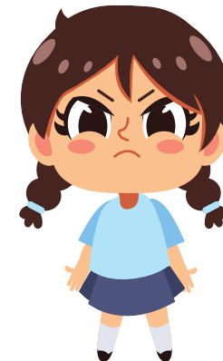
When I am Mad