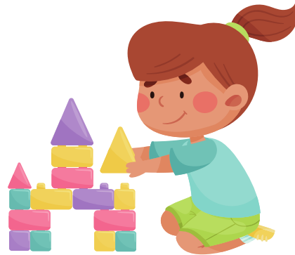
When I am Playing