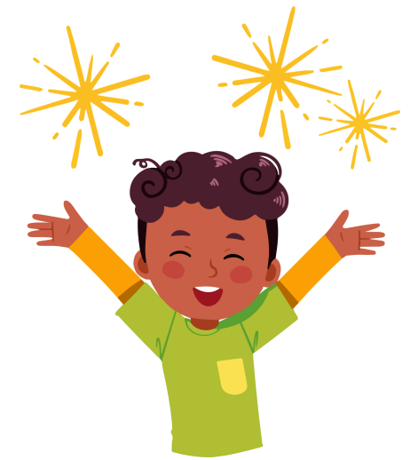
When I am Happy