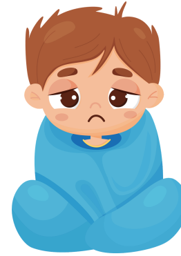
When I am Sick