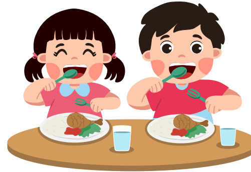
When I am Eating