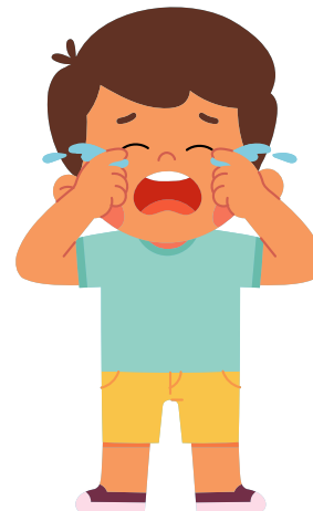
When I am Sad